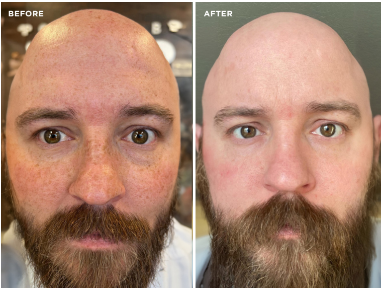
Patient with significant sun damage. Two sessions of strong IPL and great result. He said he is proud of his skin for the first time in his life.