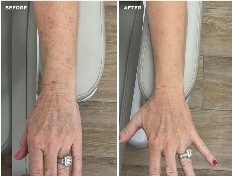
A patient with years of sun damage on her forearms. Significantly improved after one session of strong IPL treatment.